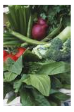
Fig. 7: Green Leafy Vegetable

Green leafy vegetables are good sources of vitamins K, though the absorption is relatively poor as it is bound to membrane of the chloroplasts. Some plant derived oils such as Soya and Canola oils are also rich in vitamin K. Further research is still required to find the bioavailability and bioactivity of Vitamin K form in different food sources.