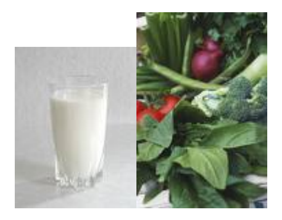
Fig 9: Milk and Green leafy Vegetable

It is widely distributed in various foods with highest concentration in liver, dried yeast, skimmed milk powder. Other good sources are green leafy vegetables, fresh milk, eggs, meat, and fish. Millets and legumes are fair sources. Milled cereals and its products, other vegetables, roots and tubers are average sources of riboflavin.