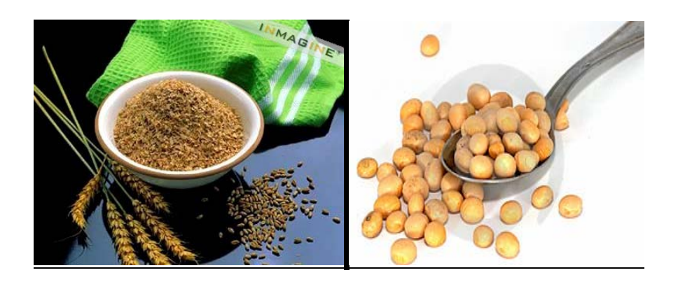
Fig. 8: Wheat, Soybean

The richest sources of thiamin are Wheat germ and Brewer's yeast. Dry beans, peas, soybeans, peanuts and egg yolk and liver are also good sources. Unmilled cereals and pulses contain high amount of thiamin whereas highly polished cereals like rice are poor source of thiamin.