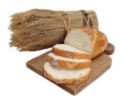
Fig. 1: Carbohydrate sources