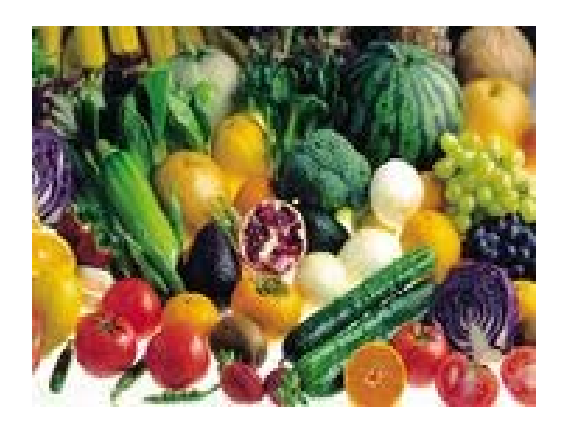
Fig. 3: Vitamin Sources - Fruits and Vegetables

Vitamins are organic compounds. Although they are required in small amounts, but are essential for many important functions of the body. They can not be synthesized by the body. Due to shortage of specific vitamins various deficiency diseases could occur. The vitamins were designated by letters A, B and so on before their structures were determined. Foods contain small quantities of these vitamins.