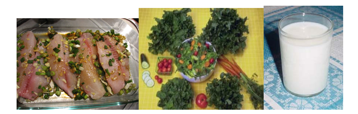
Fig. 12: Calcium sources- Fish, Green Leafy Vegetable and Milk

Calcium is present in both the plant and animal foods. Foods of animal sources are milk and fish (bhekti, chingri, rohu etc). Among vegetable sources, green leafy vegetables like amaranth, drumstick and fenugreek leaves are the richest sources of calcium. Amongst cereals/millets and pulses, ragi (millet); soybean and rajmah have high calcium content than other cereals & pulses. Nuts (almonds) and oilseeds (gingelly & mustard seeds) are also good calcium sources.